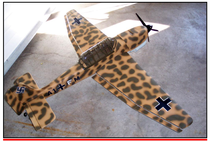
Great Lakes Model & Aviation Airshow and Expo

Held at the Stoney Creek Municipal Airport, August 20th and 21<sup>st</sup>, Stoney Creek. You should have been there!