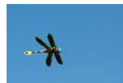
I didn't see it but it must be one of Laddie's