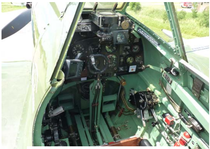
This is the cockpit of which aircraft? No prize for second person with the right answer at the September meeting.