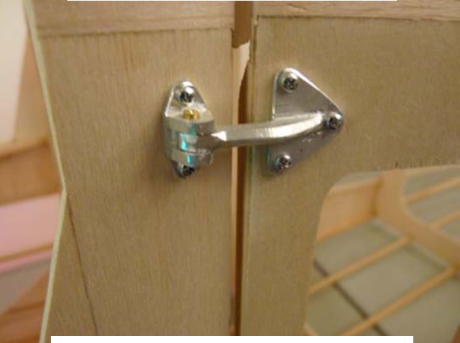
Karl Gross does some carving of hinges from a block of aluminum.