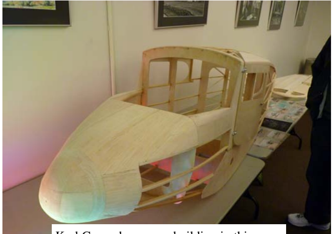
Karl Gross does some building in this case a Cessna Sky Crane